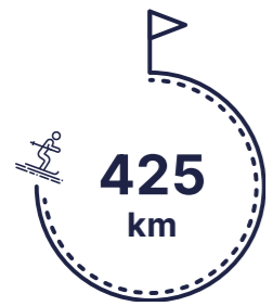
Alpine ski slopes